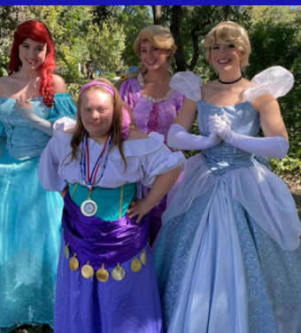
Meet a Princess