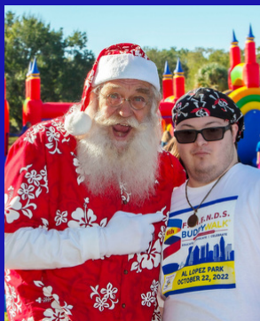
SANTA LOVES THE BUDDY WALK!