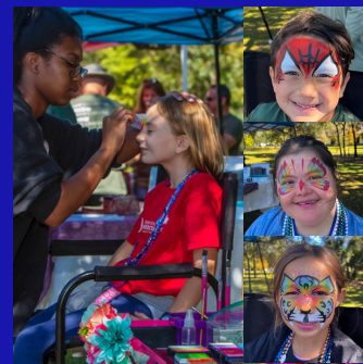
FACE PAINTING BY BRITNI