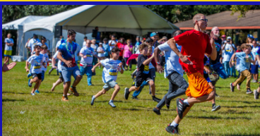
JOIN IN THE RACE!