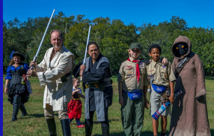
The 501st Star Wars Legion