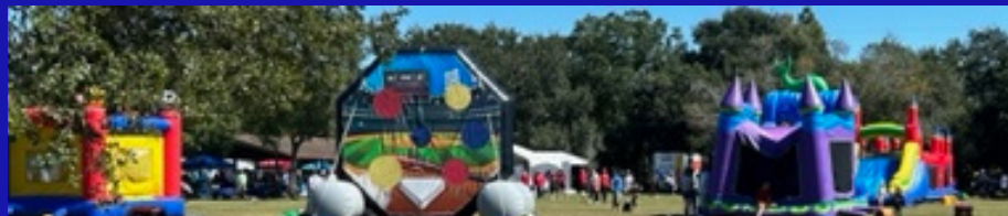
BOUNCY HOUSES & DART GAME