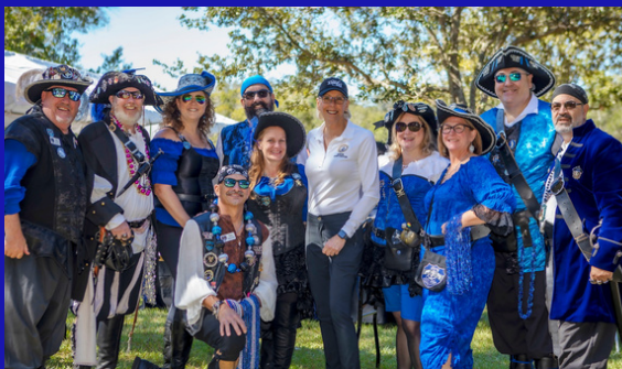
SOUTH SHORE MARADERS KREWE